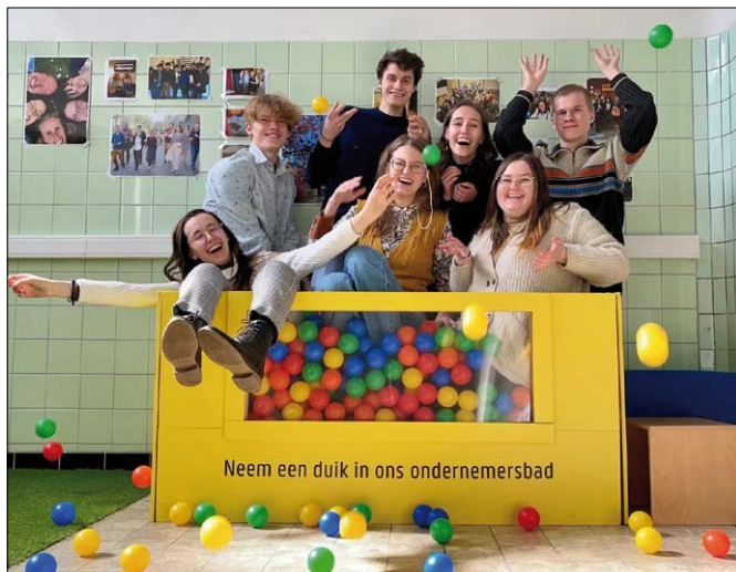
LongDragon School - Team

In total, LDS has reached 400+ children from all over Flanders and Brussels with their online and in-person lessons and workshops.