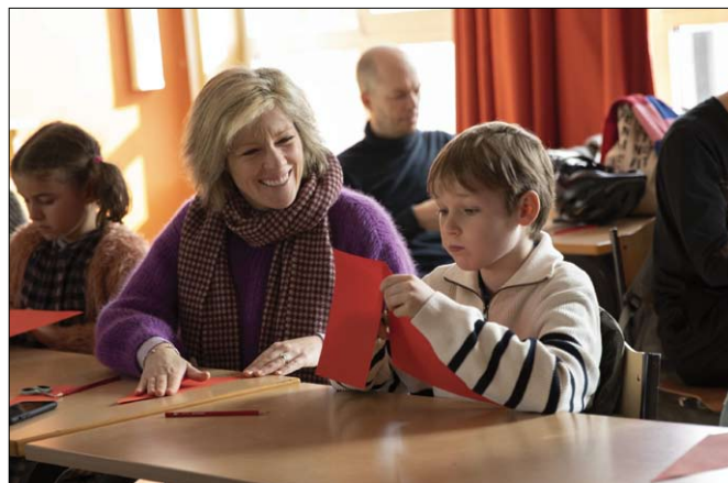
Calligraphy & Paper Cutting Workshop - MIC Festival 2023

Fast-forward to 2024, LongDragon School will continue to teach the Belgian youth, host offline events and organize summer camps. Additionally, they will build an elective course for schools. During this course, students will be able to access educational movies and challenges and be able to do homework using an online platform, on which students will receive personalized feedback from LDS teachers.